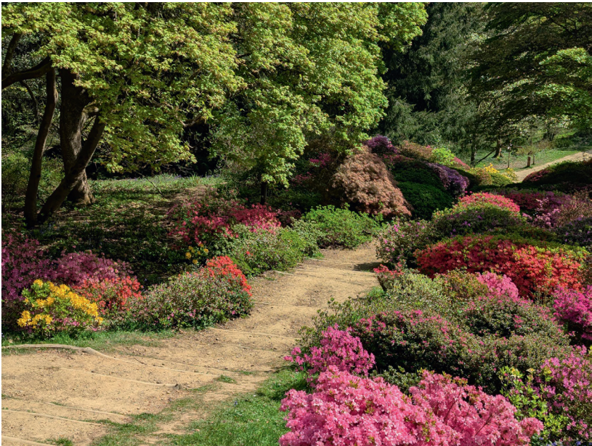
Winkworth Arboretum 2026

Working to maintain our heritage and quality of life